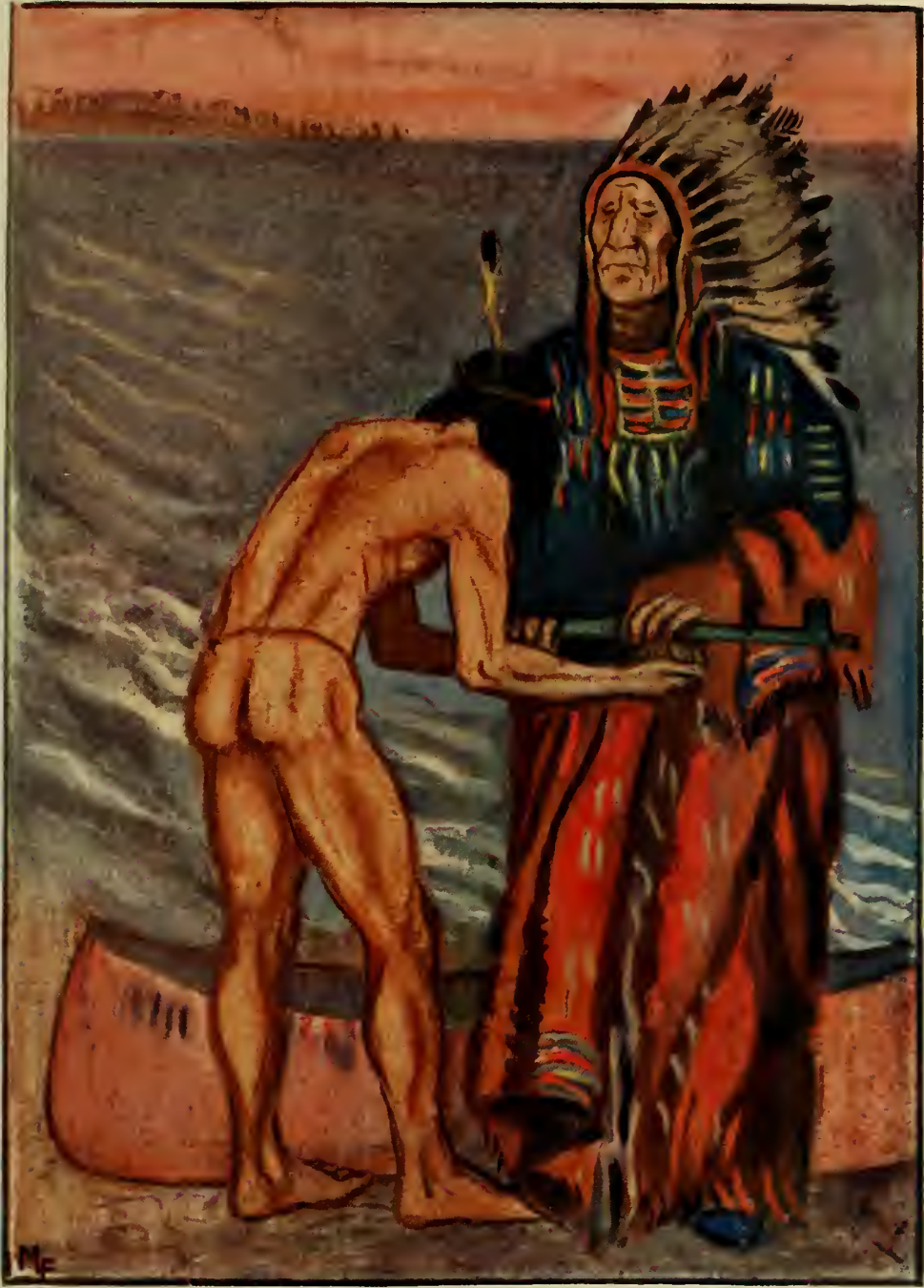
THEN THE OLD MAN GAVE THE BOY A LARGE PIPE AND SOME TOBACCO